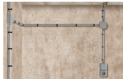
Flexible and rigid plastic pipes